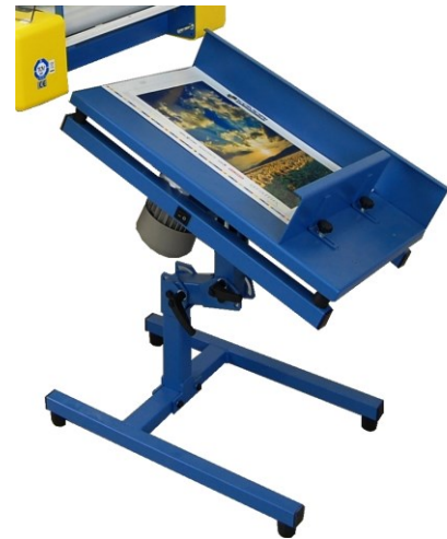
Optional Jogger 400

*Important – the machine must be operated either with a Pallet Stacker or with a Jogger.