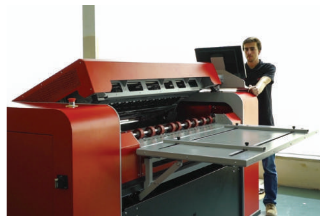
• Automatic lift for easy access & maintenance.