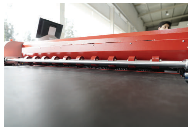
• Wide belt for perfect media transport.