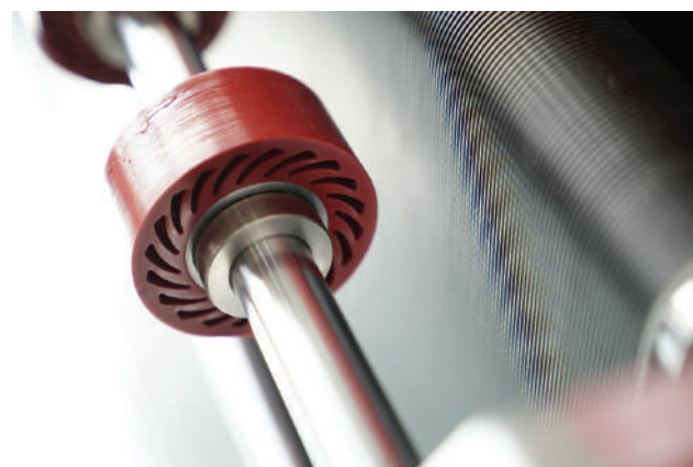
• No crush wheels prevent media damage.

Included high-powered PC allows users to install variable data software and alternative RIP solutions as your business needs development and growth.