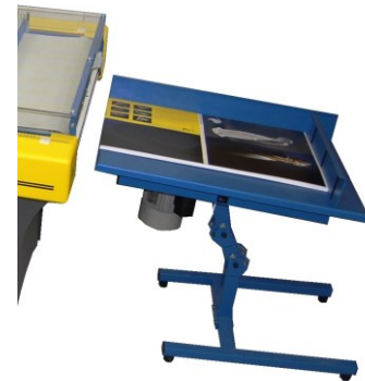
Optional Jogger 530

Second Film Supply Roll Shaft for quicker film replacement.