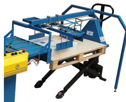
Optional Pallet Stacker(manual)