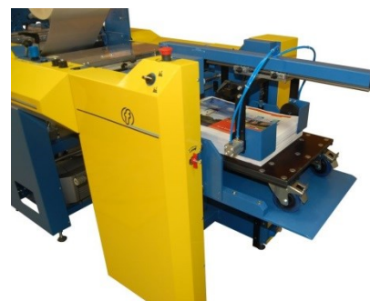
Optional Pallet Stacker