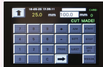
User Friendly Touch Screen

The e-cut electromechanical guillotine family is the most effective choice for small and medium size print shops. Providing the astonishing cutting experience we have reached a speed like no one else. During the designing process our aim was to produce a compact size machine with all the essential feature, which you have ever dreamed of. The dual axis back gauge driving provides long lasting and stable preciosity of paper positioning even foot pedal supports you for easiness. High level light guards are a must, however unique safety features has been developed for maximum safety experience as the side LED lights warns surrounded people for caution. Adjustable pressing force and an easily programmable versatile software helps every operator to get the most out of the machine via the color touch screen.